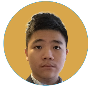
Bronx International High School