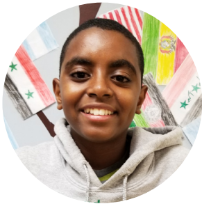
Francis Hammond International Academy

Students in our schools and academies are more successful than their district peers, graduating in higher numbers and attending colleges. We serve more than 8,500 immigrant and refugee youth across the U.S.