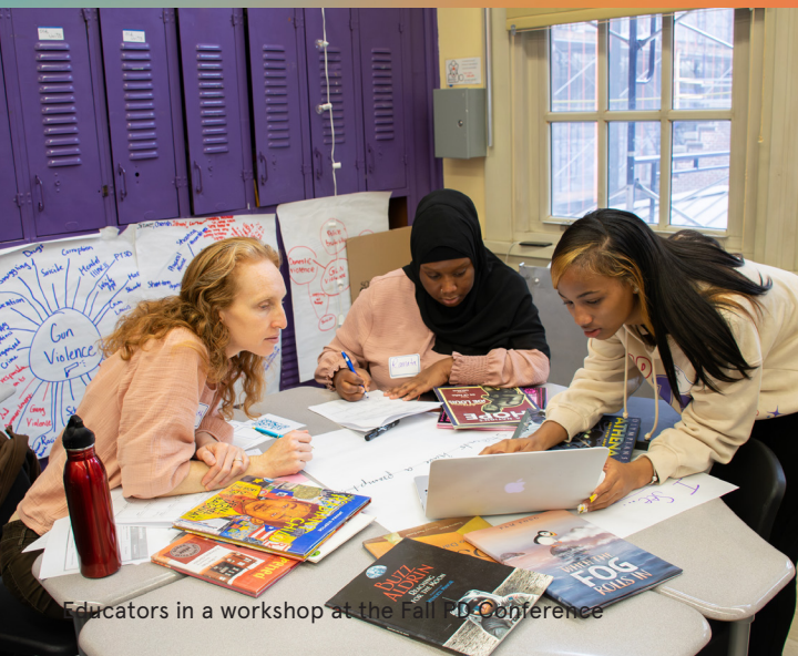
Educators in a workshop at the Fall PD Conference

We provided 550+ network educators with 3,800+ hours of professional development.