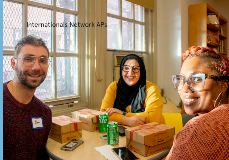
Internationals Network APs

Strong school leadership is key to making the Internationals model a reality. Internationals works intensively with new and existing leaders, both at the teacher level as well as the administrator level, through frequent meetings, professional development, and our annual leadership retreat.