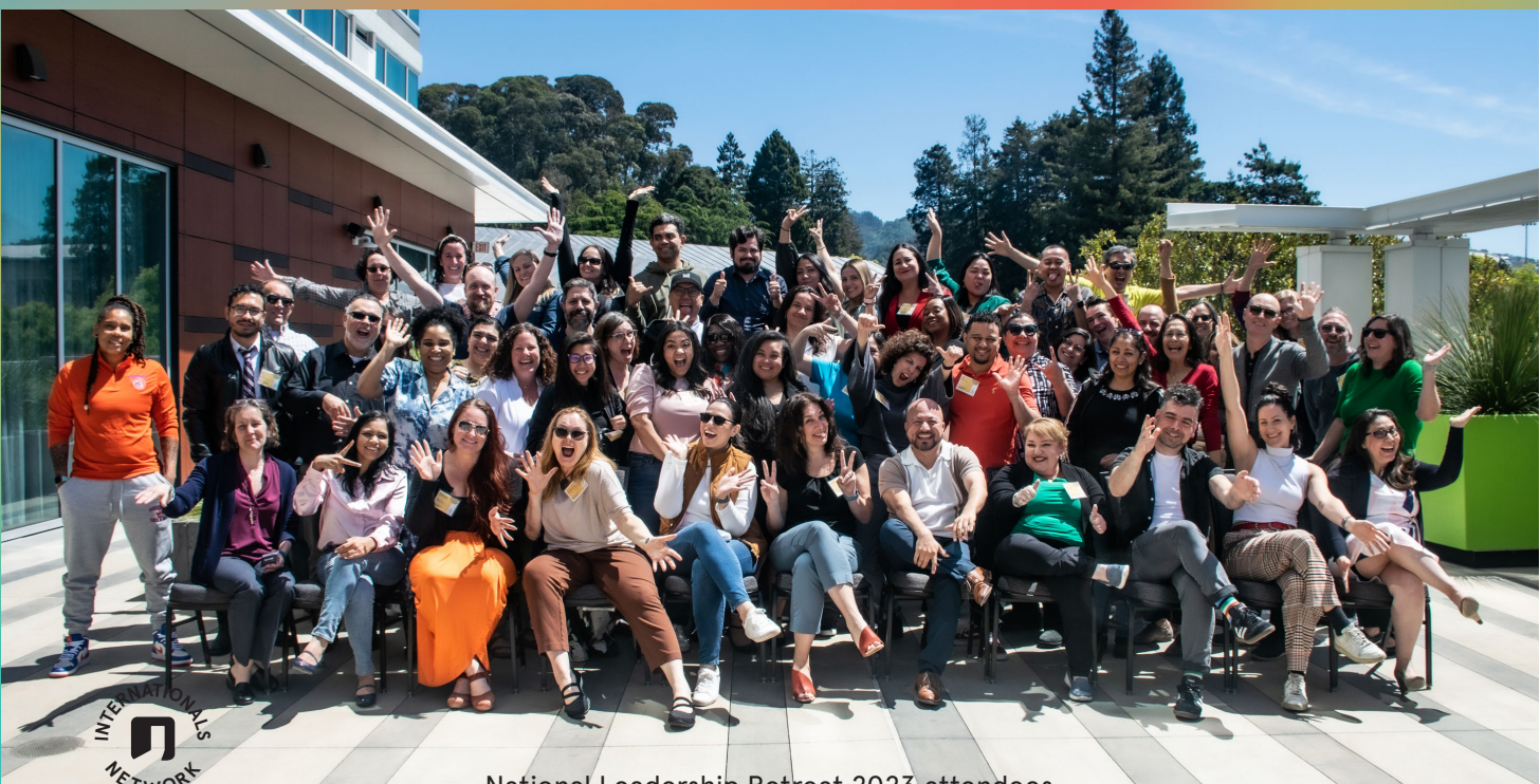
National Leadership Retreat 2023 attendees